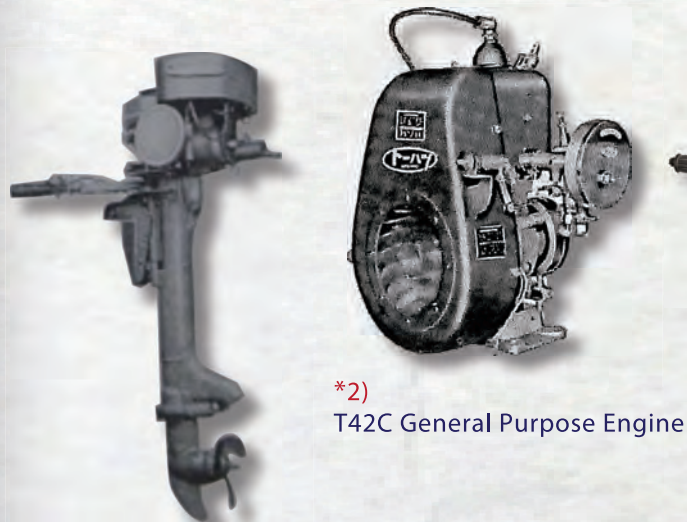
*1) First Outboard Prototype

Recognizing a strong demand from the market, Tohatsu developed the 2ps outboard model, "OB2A," in 1959. In 1961, *5) "OB2B" was released, and production totaled over 10,000 units for a single outboard. Soon after, Tohatsu began to pave the way for worldwide distribution of outboard motors.