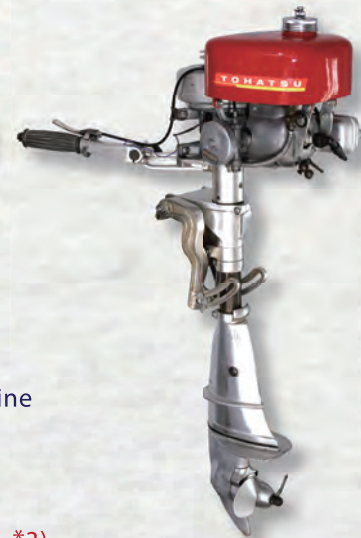
*3) Second Outboard Prototype